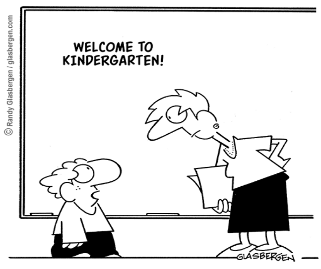
"You're telling me it will take 13 years to install my education! What kind of outdated software is this school using?"

Question 47 is based on the following comic strip: